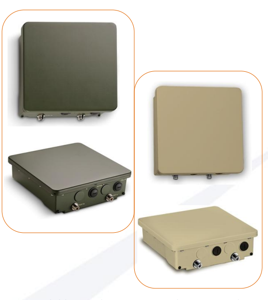
Available in Military Green and Desert Sand colors

Proxim's QoS provides higher levels of prioritization with up to 512 service level classifications, enabling superior quadruple-play applications like video, voice, data and mobility with low latency