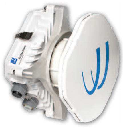
FlexPort80 with 12" (30 cm) Antenna

BridgeWave is the market leader in providing highly reliable gigabit wireless solutions. The FlexPort family of products leverages our expertise in designing and bringing to market carrier-class millimeter wave solutions that have been accepted and used in thousands of installations worldwide.